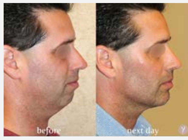
Age 44* The Y LIFT<sup>®</sup> restores and creates a youthful jawline and overall facial profile, even for men!